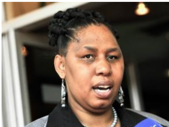
Deputy Minister for Women, Children and Persons with Disabilities, Hendrietta Bogopane—Zulu

Hendrietta Bogopane—Zulu the Deputy Minister of Women, Children and Persons with Disabilities is one of the storytellers in the books launched at the Grahamstown National Arts Festival on the 3rd July 2012. Ms Bogopane—Zulu hails from Polokwane, she is also one of the many people in South Africa living with a visual impairment.